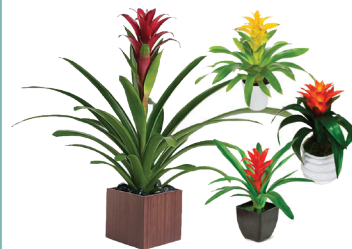
Bromeliads - 12" to 18" H $40 each