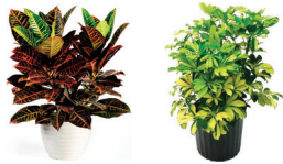
2' Green Plants