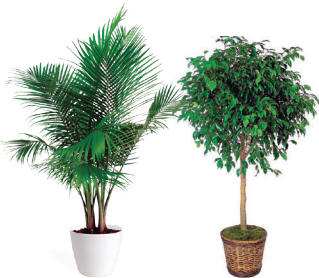
Standard 4' to 6' Green Plants