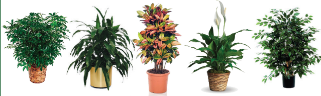
3' Green Plants