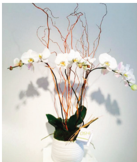
Double Phalaenopsis Plant Composition $125